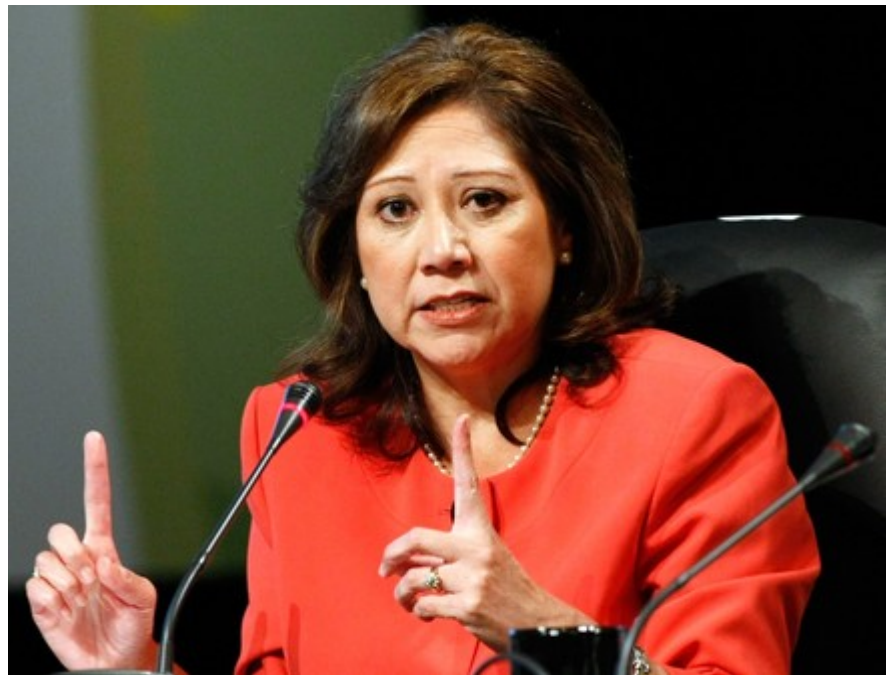
Hilda Solis U.S. Labor Secretary

"To those who have for too long abused workers, put them in harm's way, ... let me be clear, there is a new sheriff in town."